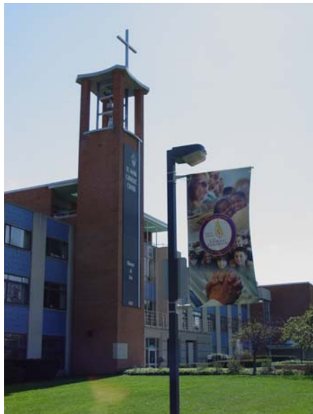
The Catholic Foundation is located in Saint Mark Catholic Center, Erie, PA.

The Catholic Foundation, established in 2007 through the generous donors of the Capital Campaign, connects people of vision and generosity to the most basic needs of our communities and our people. It is a medium for personal, powerful expressions of faith, hope and love.