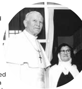
Pope St. John Paul II and Sister Lucia