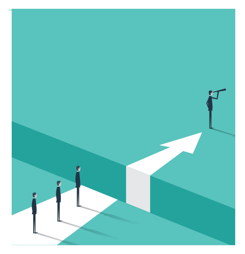
In its most basic sense, leadership is about mobilizing a group of people to jump into a better future.

Developing an effective strategy: Many parish leaders struggle to move from reaction mode to a pro-active