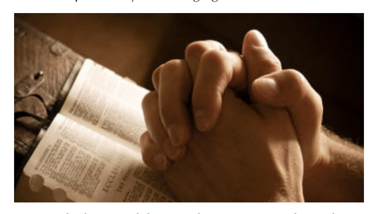
Ask the Lord for guidance, strength and perseverance in achieving your resolutions.

Make a difference in your parish community – Believe it or not, your parish community can use your talents. Offering your talents to your faith community is one of the most effective ways to feel useful and connected to others, and it is a potentially life-changing New Year's resolution.