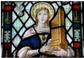
St. Cecilia Patroness of Musicians Pray for Us