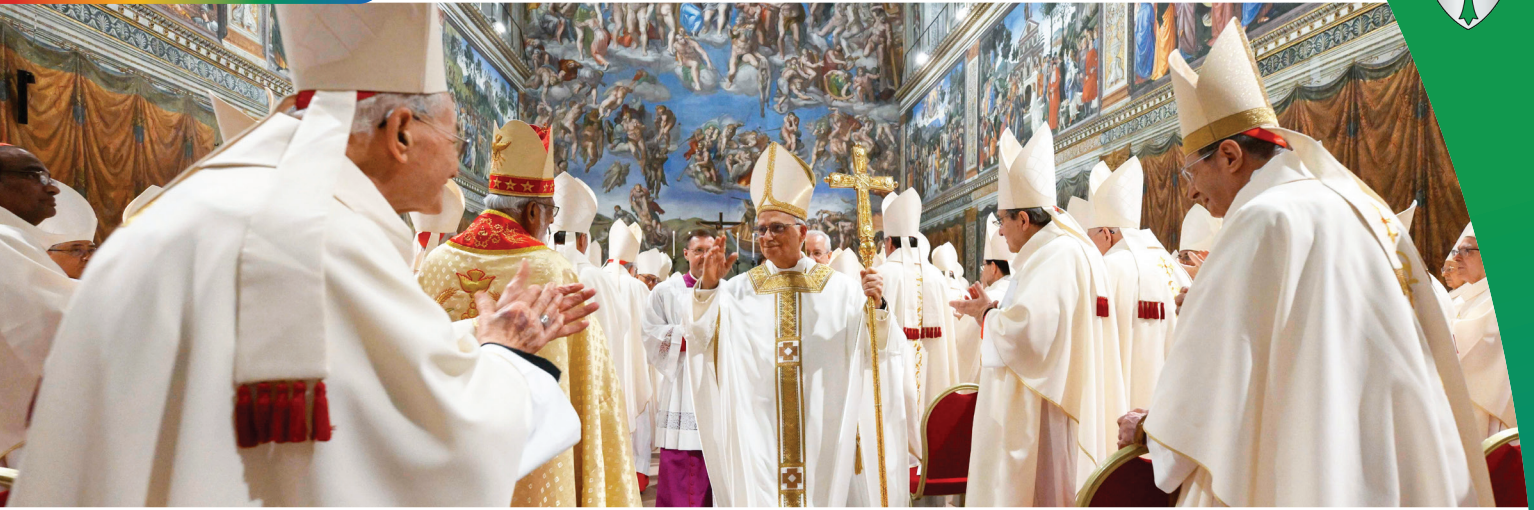
Pope Leo XIV greets Cardinals in the Sistine Chapel after he celebrates his first Mass on May 9, 2025, as the new leader of the Catholic Church.

Welcome to the Jubilee Journey: Pilgrims of Hope monthly newsletter. Join us each month for ways to stay connected and to celebrate this Holy Year.