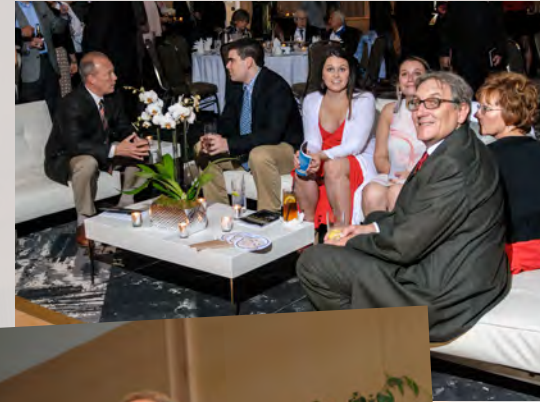
Guests are settling in and enjoying the relaxing lounge area.