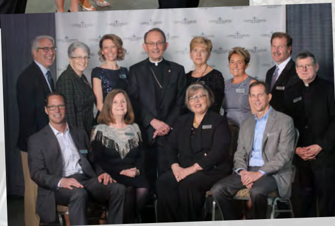
The Catholic Charities Board of Directors