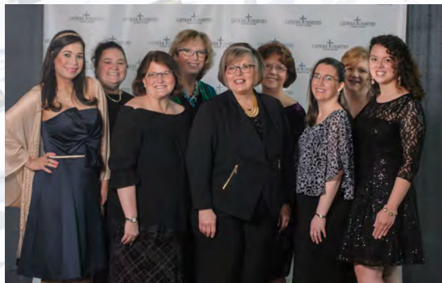
The Catholic Charities staff is all smiles!