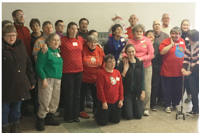
J.O.Y. ministries hosted a gathering at St. Mark Catholic Center on December 9, 2017, for an afternoon of Advent reflection.