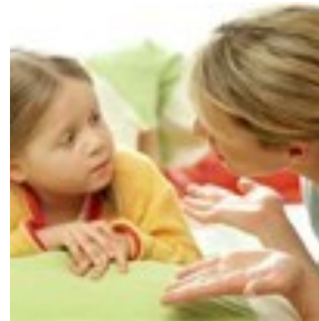
May echo words or phrases