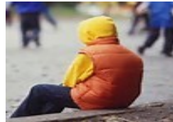
May prefer to be alone