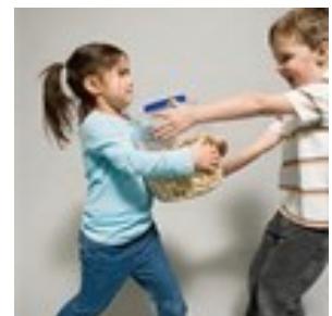
Difficulty interacting with others