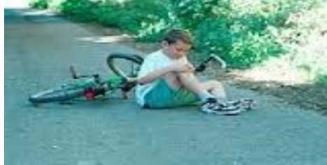
Apparent insensitivity to pain