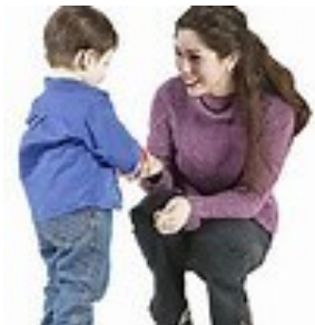
May avoid eye contact