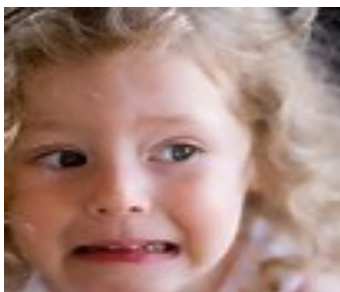
Inappropriate / extreme response to sounds / lights