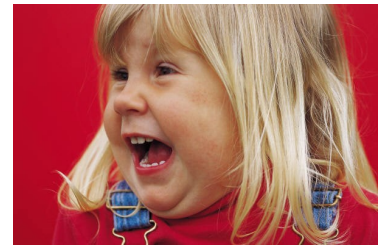
Inappropriate laughing or giggling