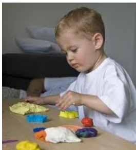
Sustained unusual or repetitive play; uneven physical or verbal skills