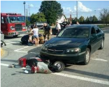
No real fear of dangers

Persons with autism may possess the following characteristics in various combinations and in varying degrees of severity.