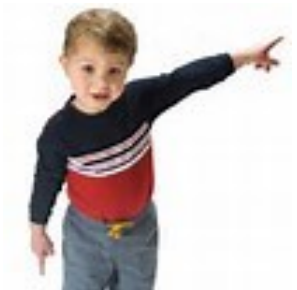
Difficulty in expressing needs; may use gestures