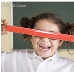
Inappropriate attachments to objects