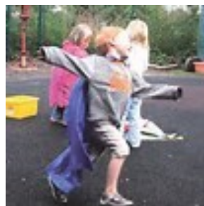
Spins objects or self