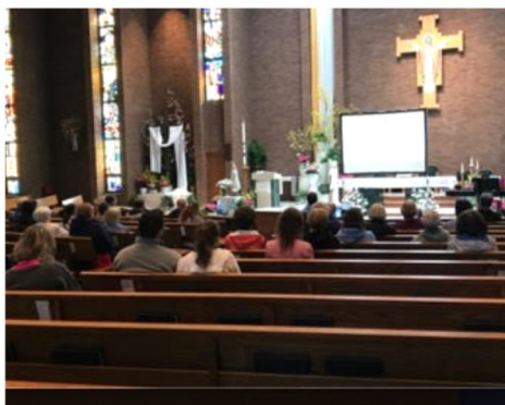
Our Lady of Peace Life in the Spirit Seminar