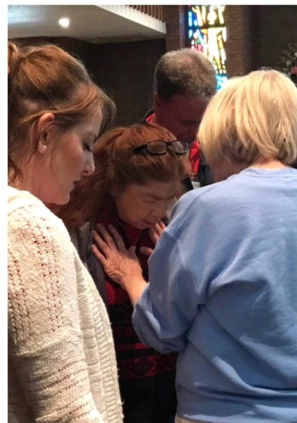
OLP Life in the Spirit: Prayer for the Baptism of the Holy Spirit