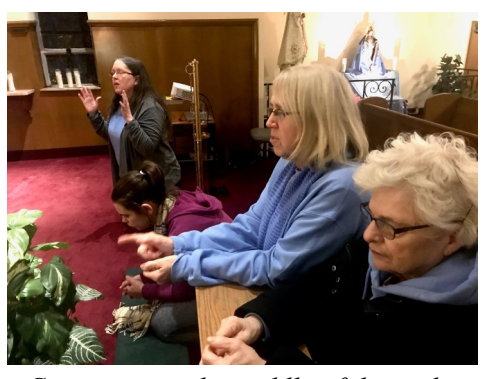
Crying out in the middle of the night

upon the Church, for an end to the curse of abortion, for true revival and conversion of hearts, for the ordained, for families, the sick, and for so much more. For mercy. After we left, we all separately experienced a spiritual KNOWING that strongholds over this region were being broken and that our many prayers had been heard. Kind of like having a baby, which is so hard at the time, but when the joy comes, you aren't able to focus on the pain: we all had the same thought.... We can't wait to do it next year!